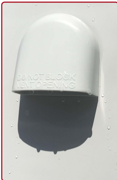
Stahlin standard vent installed on a polycarbonate enclosure.