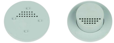
REDV1PVC OR REDVK3KIT