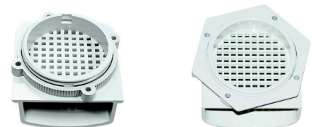
REV60 (60MM), REV80 (80MM)